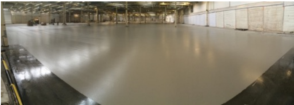
Figure 7: Finished high performance industrial floor

This patented high-performance system offers a wide range of applications, e.g. as highly stressed industrial floors, parking areas or deflecting surfaces and represents an economical and durable alternative to sophisticated reconstructions of reinforced concrete surfaces.