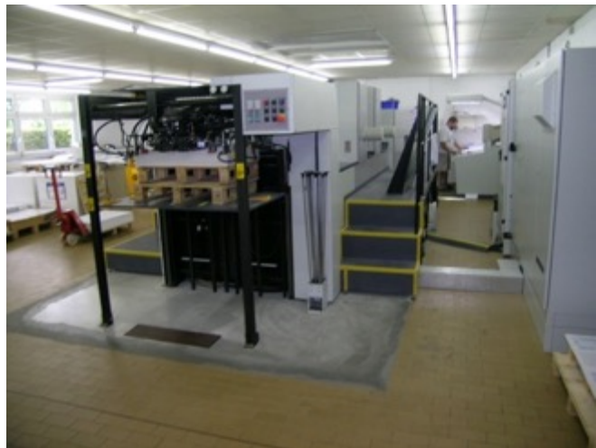
Figure 6: Manufacturing of MicroMat® and mortar infiltration (left); Burden of a DUCON surface 2 days after manufacturing by a printing machine (right)