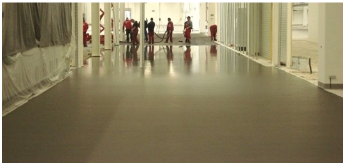
Figure 4: Mortar infiltration (above) and finished overlay (inside) (below)