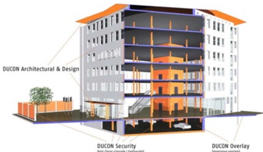
Figure 1: DUCON Fields of application

The patented DUCON®-Technology is unique and contributes now for more than ten years to the success of new construction and renovation projects and meets special challenges in the areas of security, industrial overlay/coating, architecture and design.